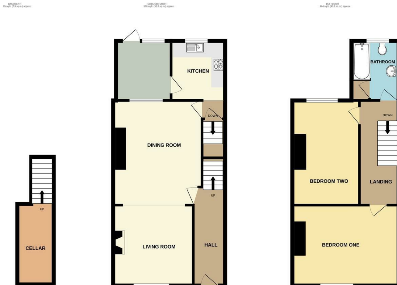
TOTAL FLOOR AREA : 1118 sq.ft. (103.8 sq.m.) approx. Measurements are approximate. Not to scale. Illustrative purposes only Made with Metropix ©2026